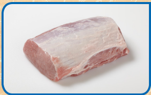
New York Roast