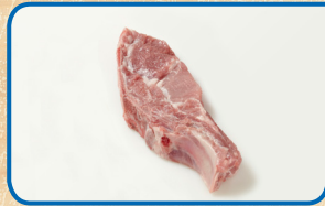
Loin Country-Style Ribs; bone-in