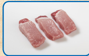
Loin Country Style Ribs; boneless