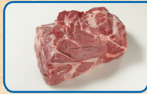
Shoulder Roast; bone-in