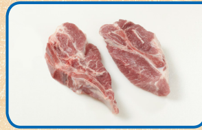
Shoulder Country-Style Ribs; bone-in