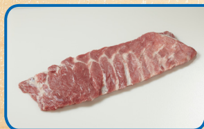
St. Louis-Style Ribs

For recipe ideas visit: www.PorkBeInspired.com