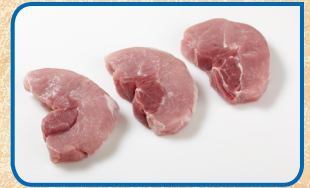
Sirloin Chop; boneless