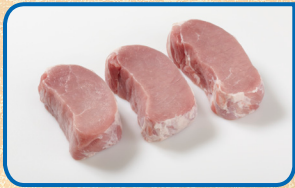
New York Chop