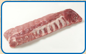
Loin Back Ribs