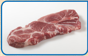
Shoulder Steak; bone-in